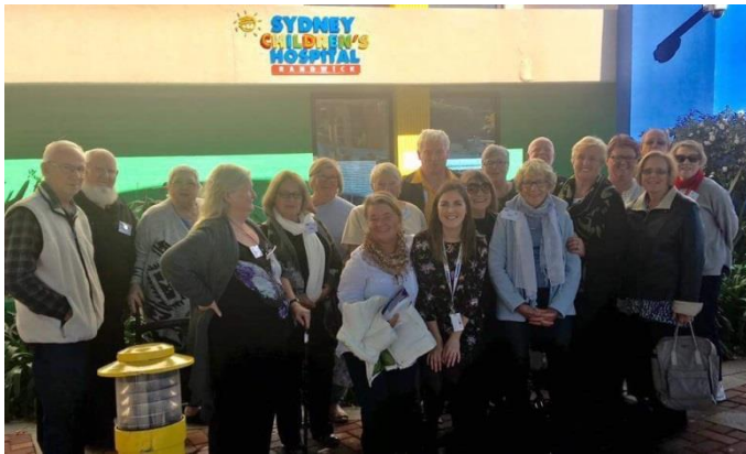
Rally for Recovery team at the Sydney Children's Hospital Randwick

At the end of May about 20 of our members made the trip up to Sydney to visit the Kids Cancer Centre at Randwick. We had a wonderful visit and saw firsthand the work that they do and learnt more about just how important our fundraising efforts are.